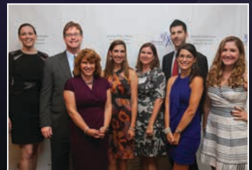
The Alliance for Aging Research staff celebrate a successful Annual Dinner